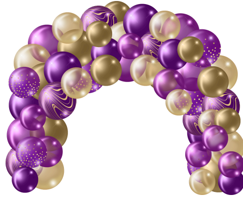
Balloon Arch starting at $125 (no backdrop)