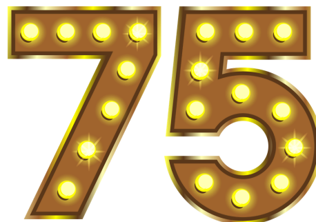
Marquee Numbers/ Letters starting at $50 $100 w/ balloons