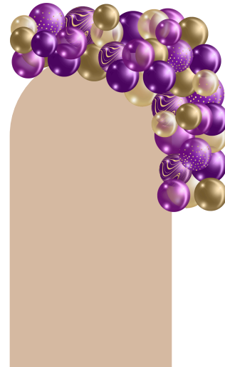
Balloon Wall starting at $200 * additional $50 per pannel.