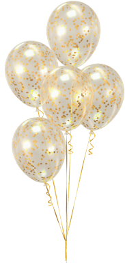
Balloon & Floral Centerpieces starting at $50 each.